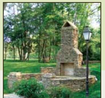
Images represent amenity and housing types being constructed in Washington Gates