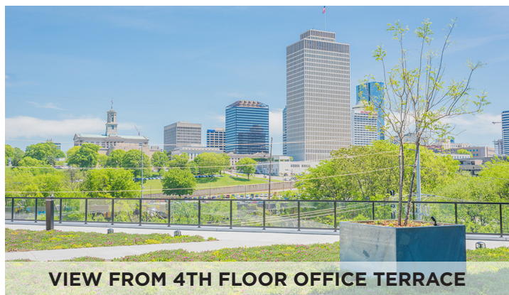
VIEW FROM 4TH FLOOR OFFICE TERRACE